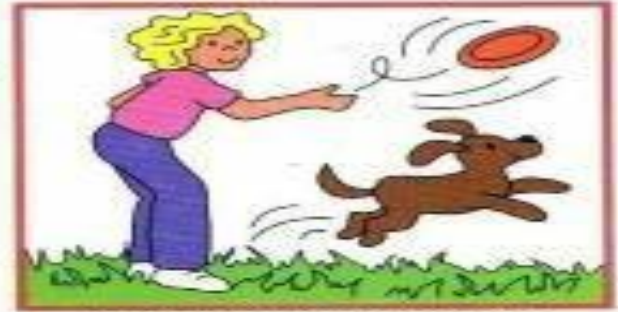
She throws the Frisbee to Spike.