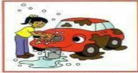
She scrubs the car with soap.