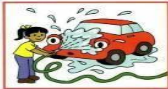
She washes the soap off with the water hose.