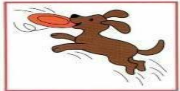
Spike catches the Frisbee.