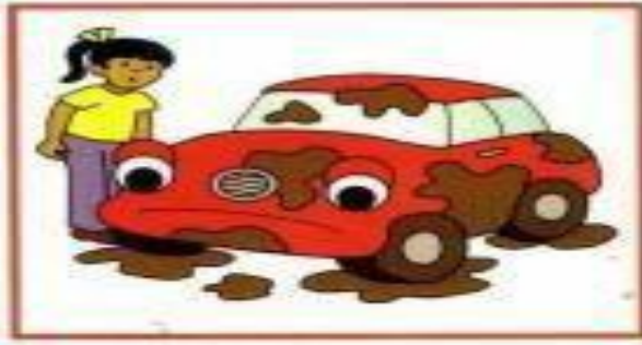
My sister has a dirty car.